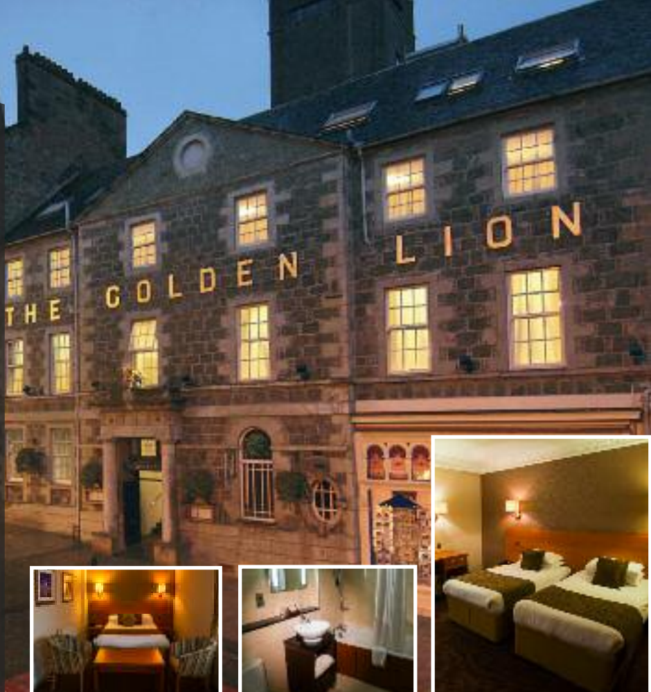
Examples of the Golden Lion's superbly luxurious Superior Rooms

Close to inspirational Stirling Castle, and a short trip from the famous Monument to William Wallace, the stylish Golden Lion welcomes locals, tourists, corporate executives and partygoers alike. Discover more at www.thegoldenlionstirling.com .